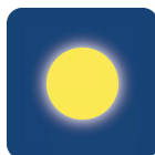
Amber when ON

Thanks to cutting edge interference and absorber coating